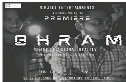
Movie by directed and produced by Subodhians

Nirjeet Entertainments organized film-making and acting workshops for our students. A movie 'Bhram' was made by Subodhians after the completion of a ten-day workshop. It would be a part of the competition in Khamma Ghani Film Festival 2024. The entire movie was shot in the college premises with active involvement of the students in all aspects of movie making.