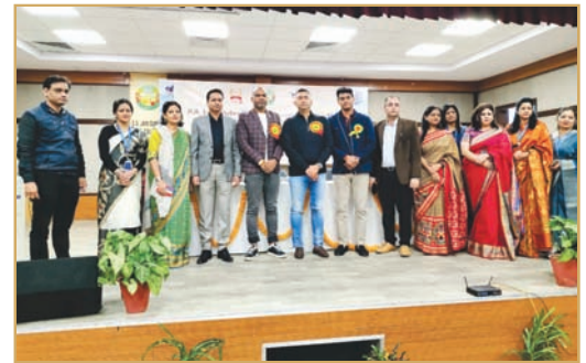
Workshop on “Creating an Ecosystem for Startups”