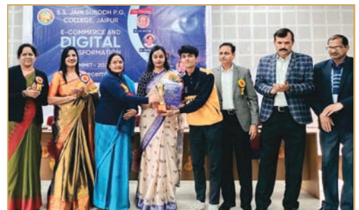
E-Commerce and Digital Transformation Summit- 2022