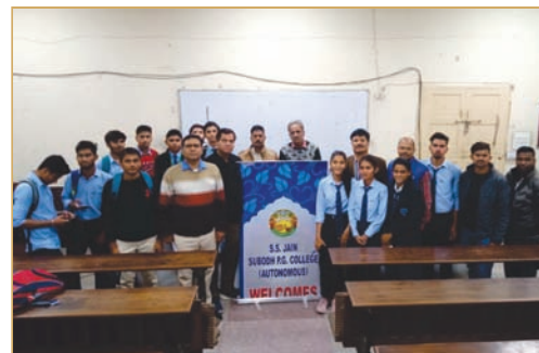
Students Registration in Voting List