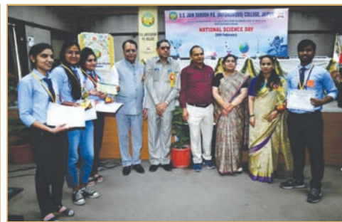
National Science Day-2023