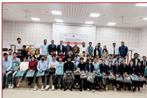
Workshop on Gender and Child Rights

Department of BBA organized a Teacher's Day best message online contest in collaboration with International School of Business & Media, Pune. Students participated in large numbers. A jury of experts decided the winners.