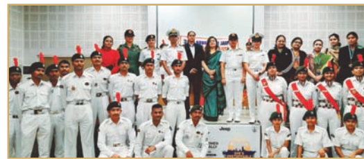
Workshop on Career Opportunities in Armed Forces

NCC wing of the college organized a workshop on Career Opportunities in Armed Forces for the students on February 15, 2023. A team of serving women officers of the Indian Navy interacted with the students and shared valuable information with them.