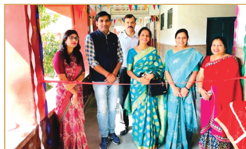
Intra-college Poster Making Competition

Department of Computer Science organised an Intra-College Poster-Making Competition' on Nov. 12, 2022, on the theme “Growth of Science & Technology after Independence” in digital & handmade form. Total 74 students participated in the competition. Winners were rewarded with trophies and certificates.