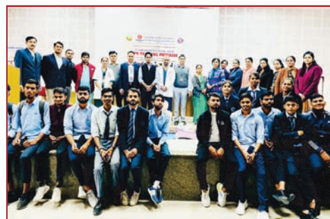
CPR Training Program

A workshop on gender and child rights for NSS volunteers was organized under the joint aegis of UNICEF and Budget Study and Research Center Trust, Jaipur at the college campus.