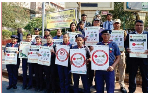
Road Safety Week -2023