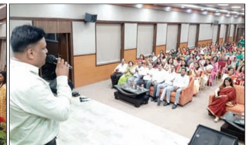
Teachers Cultural Fest